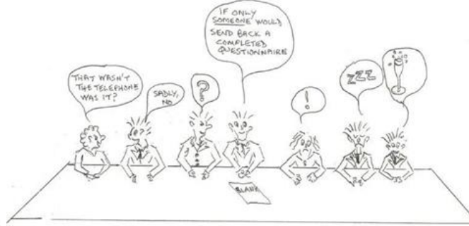
Steering Group No 2