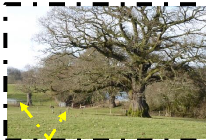
Gates on ‘ PERMISSIVE Footpath’.