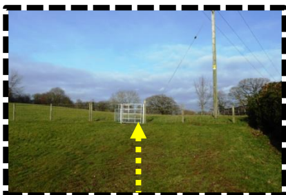
Gate on PERMITTED Footpath.