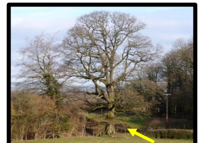
Gate towards ‘Castle Weir Farm’.